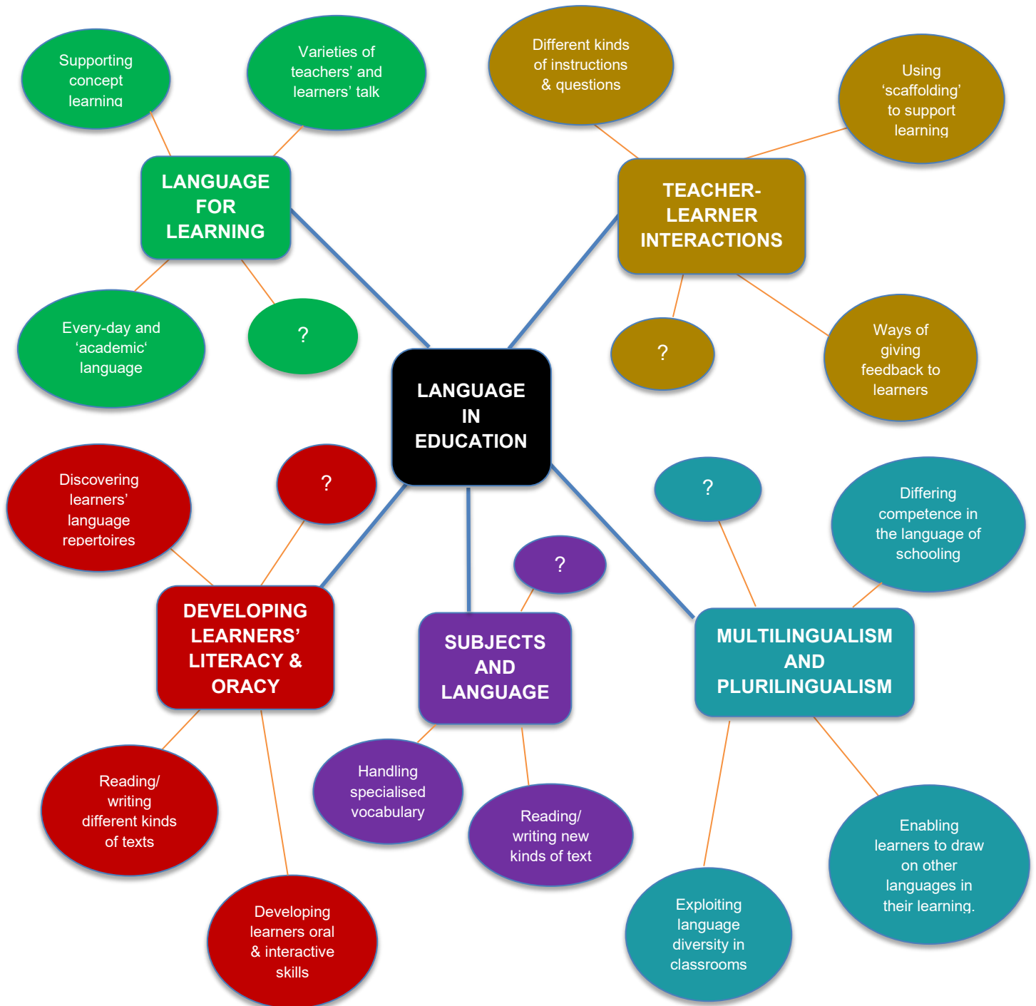
Figure 2: Mind map of some areas of language-sensitive education

Figure 2 below is a mind map of some areas of language-sensitive teaching that could be addressed in pre-service and in-service teacher education. How important are they in your context? Which other aspects of language-sensitive education are important in your context?